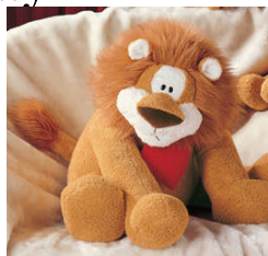
Large 10" $39.98 Medium 7" $19.98

Choose your favorite size and have it gift bagged FREE.